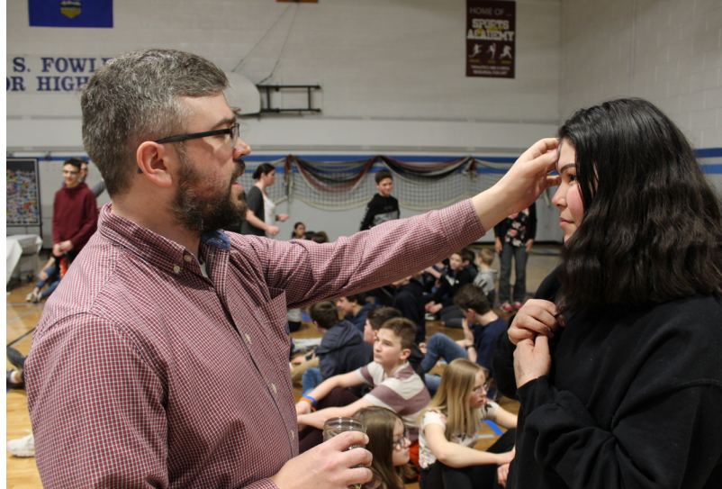
Ash Wednesday celebration at R.S. Fowler Junior High