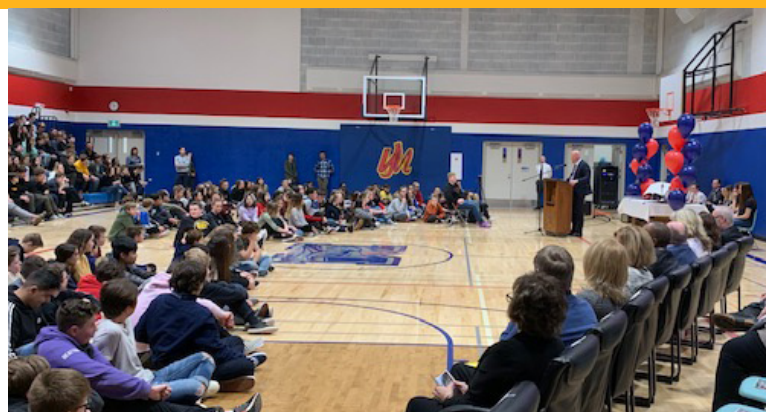
Students, staff and dignitaries gather to officially re-open Vincent J. Maloney Catholic Junior High

Dignitaries and the V.J. Maloney School Community gathered to cut the ribbon to mark the completion of their second school modernization.