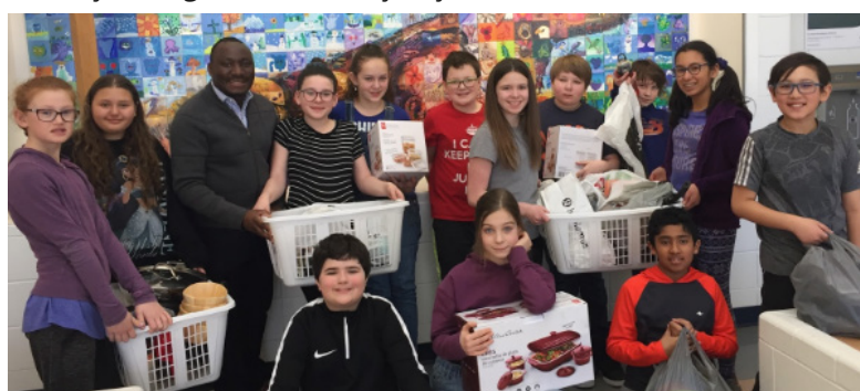
EMP students with the kitchen items they donated to the La Salle Shelter.