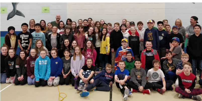
Grade 6 students participated in the annual JJN Wake-a-thon and raised $1200 to support Catholic Social Services.

The Students at EMP donated kitchen essentials to the La Salle Shelter in Edmonton during the months of February and March. Students from the Faith on Fire option group were able to learn more about the La Salle Shelter and the services it offers to women in need. These items are much appreciated and will offer a helping hand to these families in need of having a fresh start.