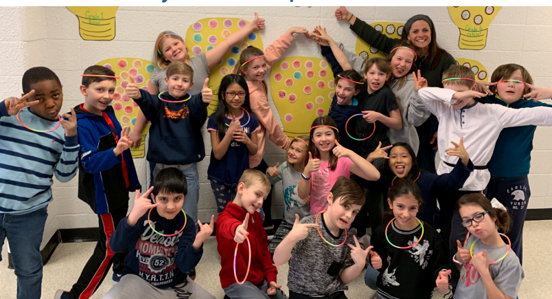
Bertha Kennedy students participate in a faith retreat.