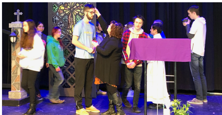
MCHS celebrates Ash Wednesday.