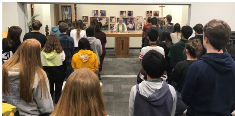
Mass in the Chapel at St. Albert Catholic High School

Students and staff at Legal School have been engaged in weekly learning about gratitude during our Monday morning assemblies. Students have been writing reflections in their gratitude journals as well as contributing to our "Gratitude Graffiti Wall".