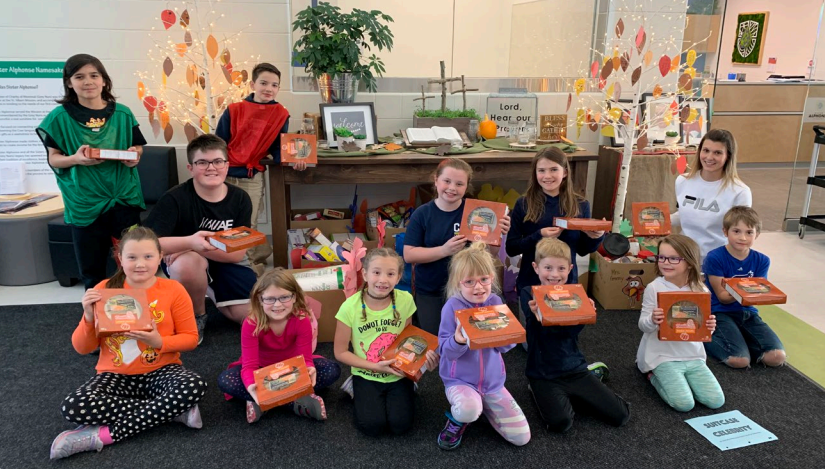
Sister Alphonse Academy Food Bank Drive