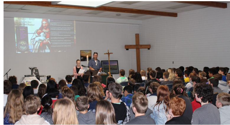
Richard S. Fowler Student Retreat

Students, staff and parents of Sister Alphonse Academy gathered to give thanks to God during their Thanksgiving Liturgy. School spirit teams gathered and organized food for the local Food Bank, and it was tallied by the grade 2/3 class. All together 3380 items were collected for the St. Albert Food Bank. Students and staff prepared and enjoyed a turkey dinner for our Harvest Lunch.