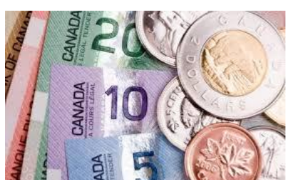
Aug 31, 2015 Accumulated