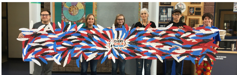
Students at MCHS commemorated Orange Shirt Day by unveiling an art piece centred on the theme, Every Child Matters.

G.H. Primeau Faculty volunteered on their Retreat Day to help Catholic Social Services prepare for Uplift: Day of Mercy . This was their second year to volunteer with this event. The faculty sorted warm clothing, assisted in the set up for Uplift Day, and filled bags with donations that would be given to approximately 1000 people.