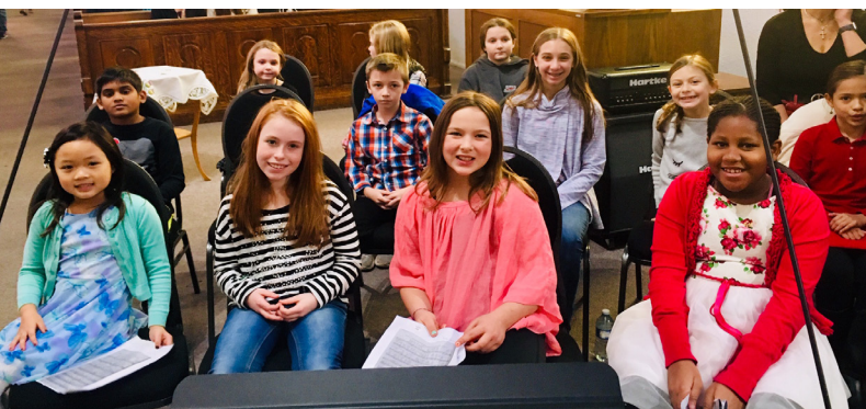
Students from Bertha Kennedy, Sister Alphonse, Ecole Father Jan and Albert Lacombe elementary schools made up the student choir that sang at the 11:00 a.m. children's mass at St. Albert Parish.