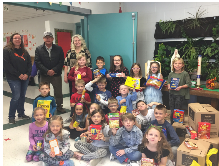
École Notre Dame students with some of the 800lbs of food they donated to the Morinville Food Bank.