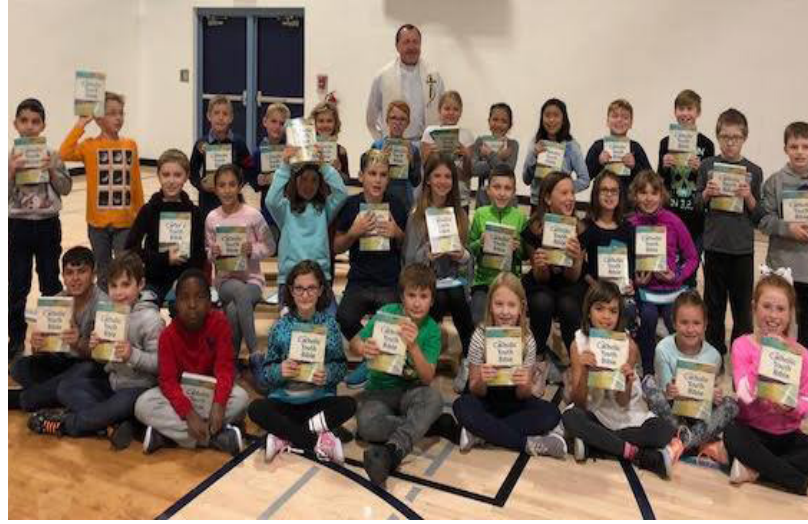
Grade 4 students at Bertha Kennedy received their Bibles at the opening liturgy in September.

As a school community, École Notre Dame has embraced October as the month of the Rosary and have included daily lessons and prayers on the Rosary for our entire student body. We will culminate our celebration of the Rosary by sharing a 'Living Rosary' with all of our Religion students; helping them develop a deeper understanding and appreciation of the Rosary as it is presented in a faith-filled and interactive manner.